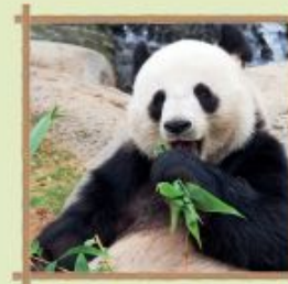
The Giant Panda Bear